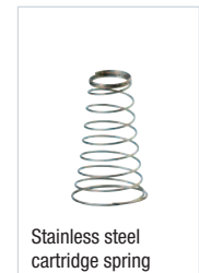
Stainless steel cartridge spring

ATLAS FILTRI® is a registered trade mark of ATLAS FILTRI srl. Unauthorized use of the registered trade mark is strictly forbidden. Images and texts are property of ATLAS FILTRI srl, which reserves the rights to change products design and specification without prior notice.