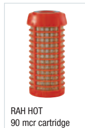
RAH HOT 90 mcr cartridge