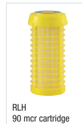
RLH 90 mcr cartridge