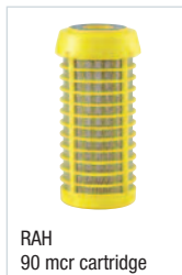
RAH 90 mcr cartridge