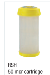
RSH 50 mcr cartridge