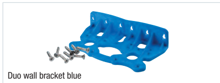
Duo wall bracket blue